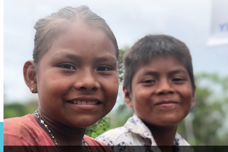
Your gifts support our international leaders, who are the driving force of our programs and services.

We want to humbly thank our generous donors for supporting these leaders and allowing our team to provide high quality, affordable health care wherever it is needed most.